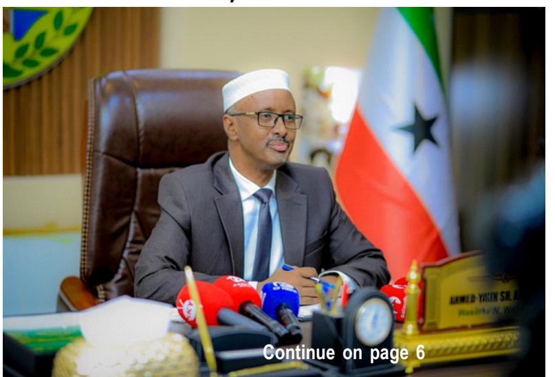
Continue on page 6