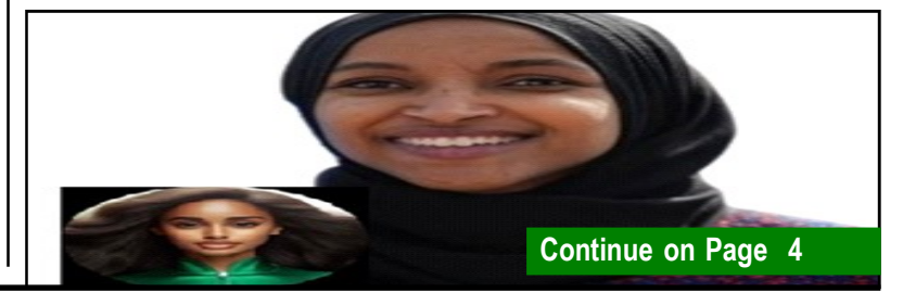
Ilhan Omar: The Shadow Ally of China, Sabotaging U.S. Interests in the Horn of Africa!