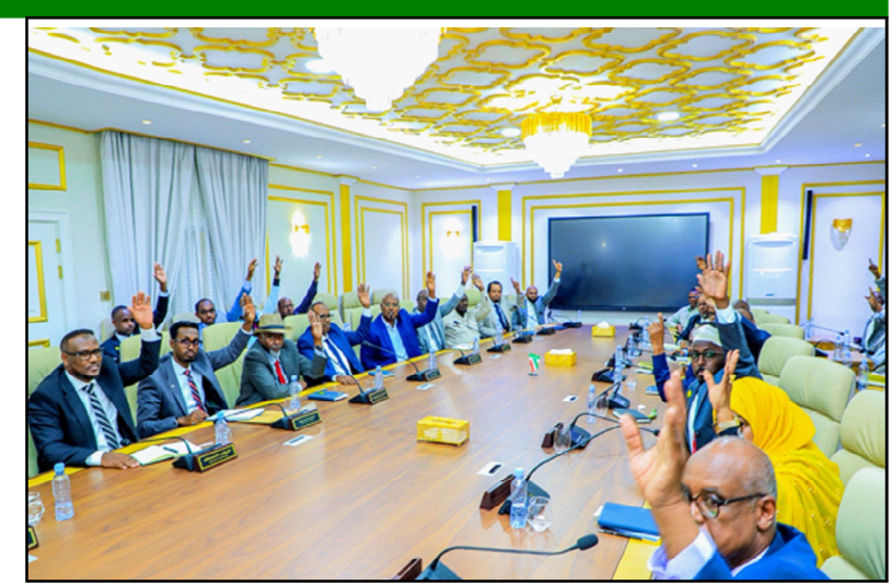
Dahabshiil CEO, UK diplomats, and Save the Children discuss growth, investment & food security

Apart from the briefing of his just Continue on Page 7