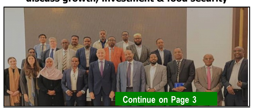
Information minister launches rigorous process to root out ghost workers